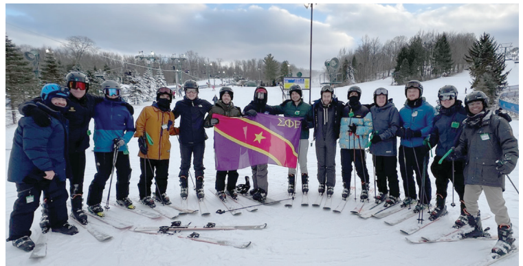
Brothers enjoy a ski trip at Bittersweet Mountain in Michigan. Attendees spent the night in an Airbnb together and skied the following day.