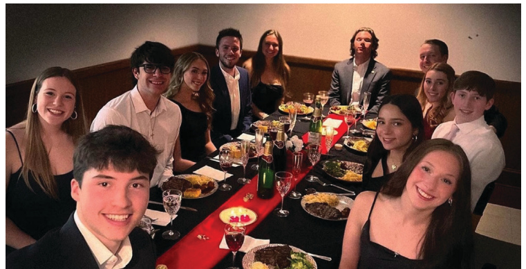
Brothers escort their chosen guests to a formal dinner provided by the chapter.