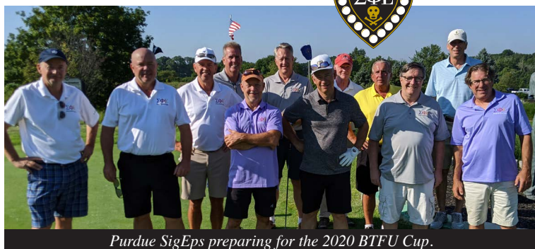
Purdue SigEps preparing for the 2020 BTFU Cup.