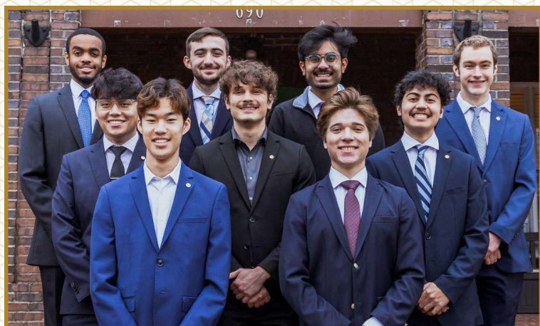
Our 2023 chapter officers.