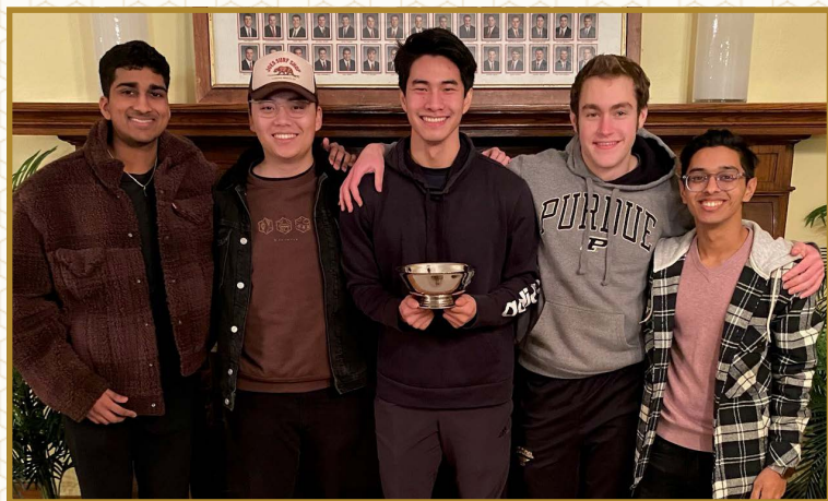
Congratulations to the 2022 executive board for being awarded the Excelsior Award for Recruitment Excellence!