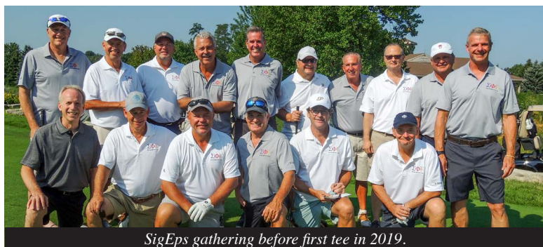
SigEps gathering before first tee in 2019.