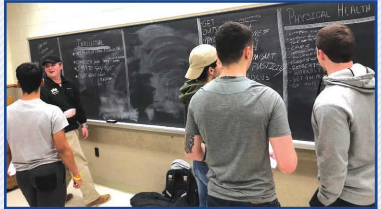
New members participate in open dialogue and exercises led by SigEp's new chapter development directors. The national staff members will remain on campus throughout the semester to continue recruiting and training our new undergraduate members.