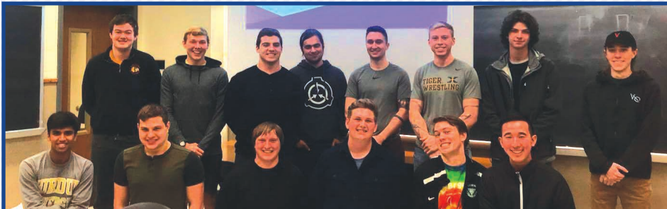
Sixteen men are making history as the 2019 recolonizing class of Indiana Alpha! They bring a cumulative GPA of 3.68 and represent Indiana, Illinois, Michigan, Kentucky, California, Colorado, and Hawaii.