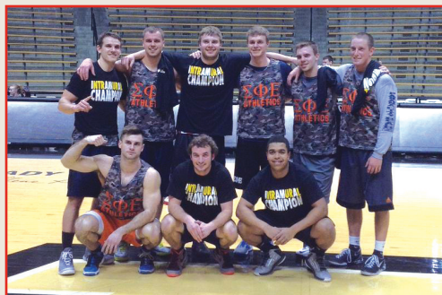
Brothers teamed up to win the fraternity gold basketball championship.

Our Indiana Alpha Chapter has been in some tough situations recently, but we are prevailing and looking forward to the future. Even through times of struggle we have stuck to the basics of virtue, diligence, and brotherly love, which has given us excellent