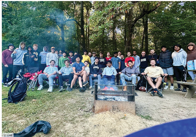
Above: Our annual camping trip! This year, brothers went to Raccoon Lake State Park and had a wonderful time getting to know the newer members of the chapter.