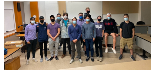
Brothers don purple during their chapter meeting to show support for survivors of sexual assault.