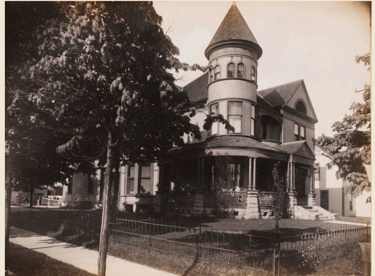
The SigEp house has come a long way! Here's a photo from 1914.