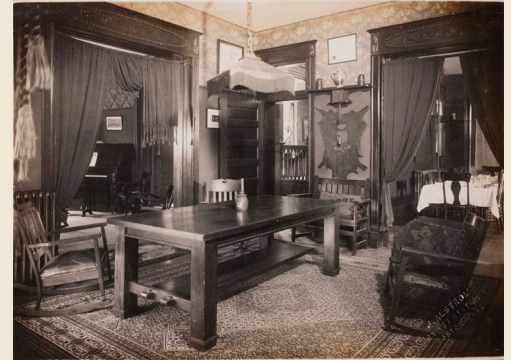
The SigEp living room from 1914.