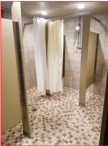
Newly installed shower partitions on first floor.

Kappa Delta has gone to great lengths to update the rooms and common areas within the SigEp fraternity house. This summer, they completed clean-up and renovations of all rooms on the first and second floors that were not completed the previous year. With new furnishings throughout and window air-conditioners in all rooms, the house was in impeccable condition for the 54 women who planned to call 690 their home this fall. It should be noted that Kappa Delta not only made their quota for this year during rush, but they are thriving on campus. Sigma Phi Epsilon has contributed to this success through the lease of our chapter house. With Kappa Delta's lease contributions, SigEp is becoming more financially viable, and the chapter house is being maintained to the highest of standards.