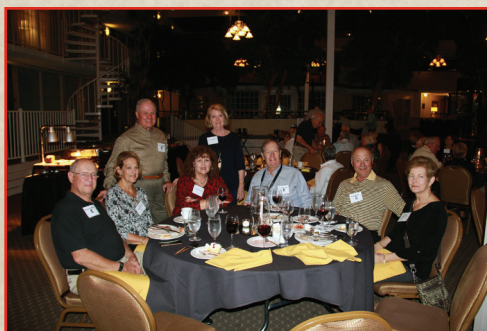
Alumni and their spouses celebrated 50 years at the reunion dinner.