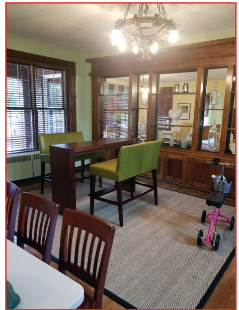
The first and second floor bedrooms and common spaces received some TLC.