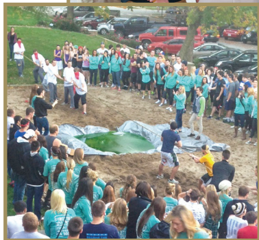
Indiana Alpha hosts Delta Zeta's annual Turtle Tug philanthropy where undergraduates compete in tug-of-war on our volleyball court.