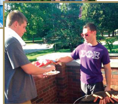
Undergraduates enjoy philanthropic barbecue on front lawn.