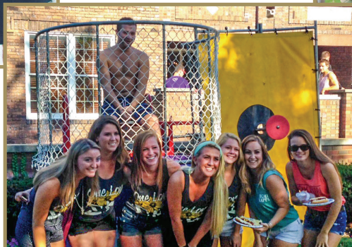
Sorority women participate in our Sink-a-SigEp philanthropy.