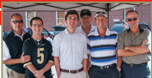
(Left) Alumni, family, and friends get together for Purdue's 2014 Homecoming celebrations. (Right) Undergraduates participate in fall 2014 recruitment.