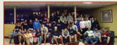
Brothers after an Indiana Alpha Chapter meeting.

The brothers from the historic walls of 690 Waldron Street continue to set the example on campus through academics, athletics, and manpower. Indiana Alpha creates and fosters a brotherhood that long exceeds our time here at Purdue. The following information is just a snapshot of what the chapter has done to better prepare each of its members for their journeys after college.