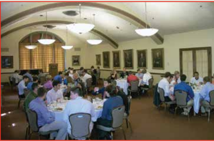
Guests enjoying dinner.